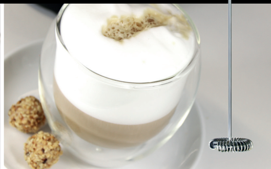
Ideal for latte macchiato