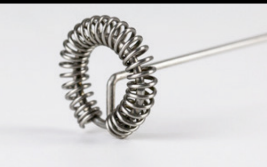
Milk frother with stainless steel spring