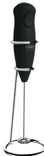
Elegant stainless steel stand