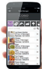
Food App + Labeling System