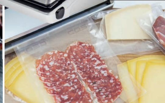
Keeps foods fresh up to 5 X longer