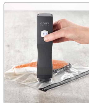
Suitable for hand-held vacuum sealers e.g. CASO One Touch Cordless Vacuum Sealer (item 11301)

+ Optimal accessories for your CASO One Touch Cordless Vacuum Sealer (Item 11301)