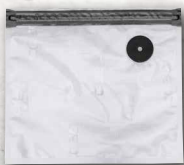
8 Half Gallon zip bags (10.2" x 9")