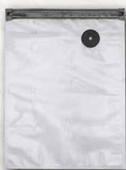
6 gallon zip bags (10.2" x 13.8")