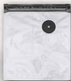
6 Quart zip bags (7.9" x 9")